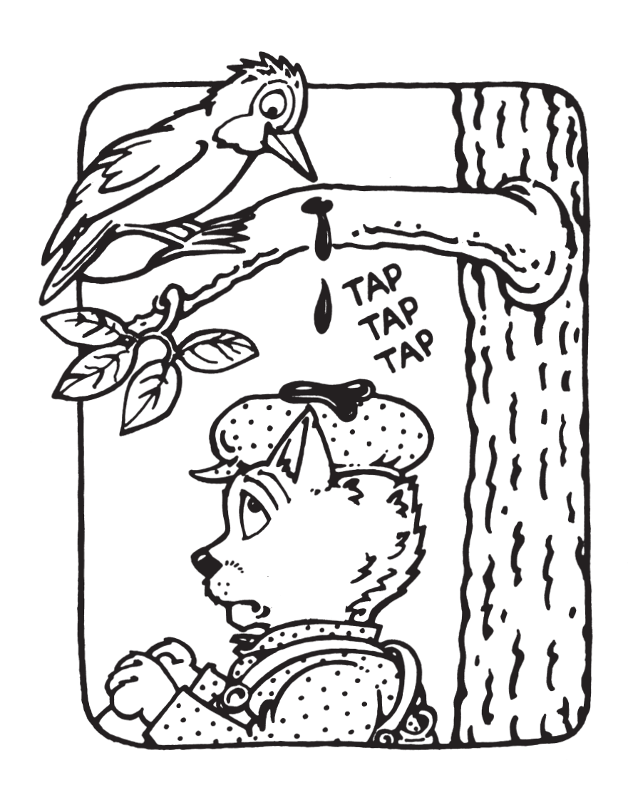
Tap, tap, tap. Can Pat nap?