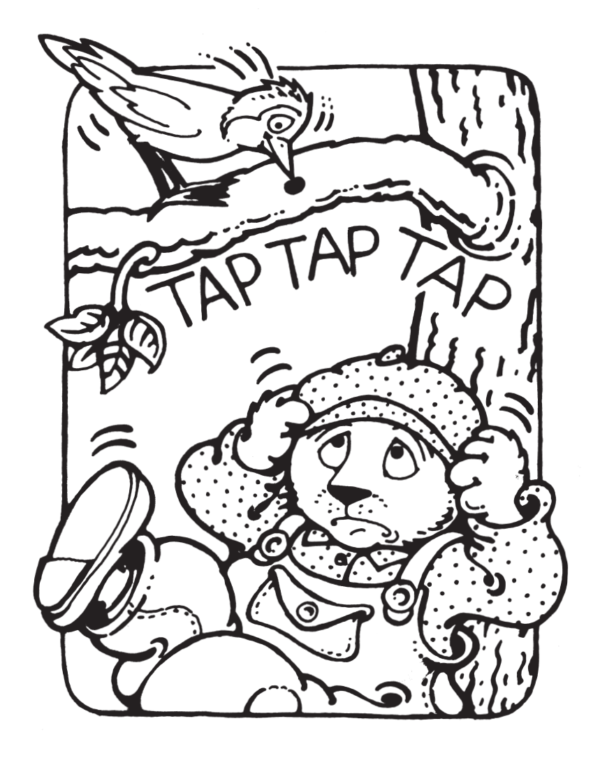
Tap, tap, tap. I can tap.