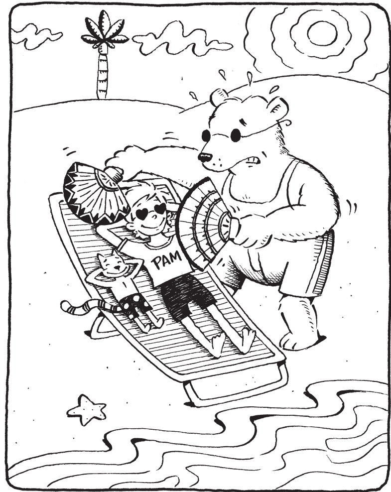
Fan Pam, Sam.